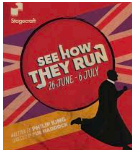
Designed by Scenario