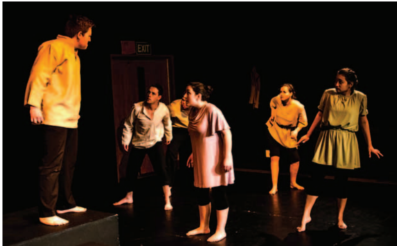
A scene from Oedipus the King (extracts) presented by FAHS Feilding High School