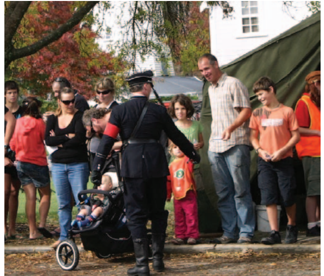
A patrolling Nazi checking IDs in 2011.